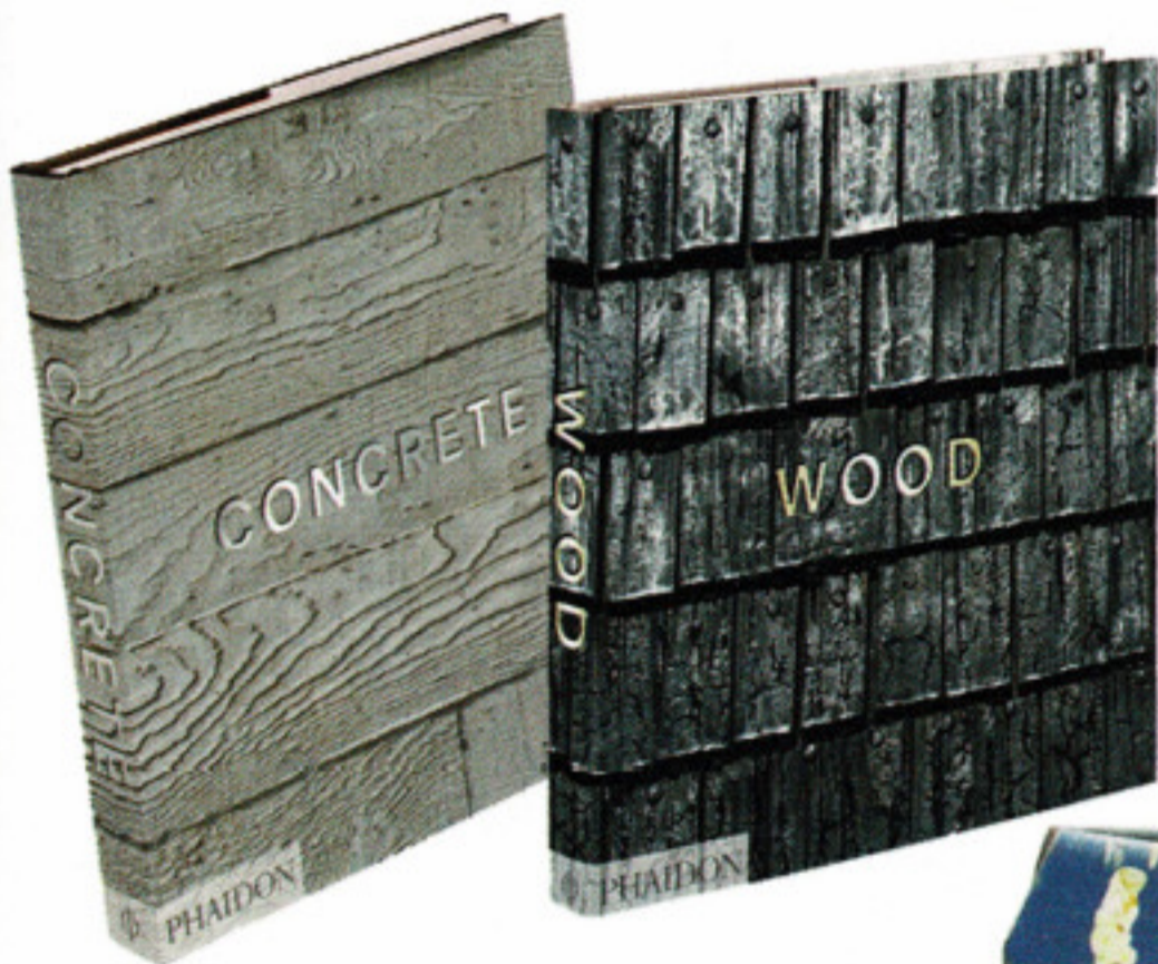
Concrete and Wood by Phaidon coffee table books from Island Books