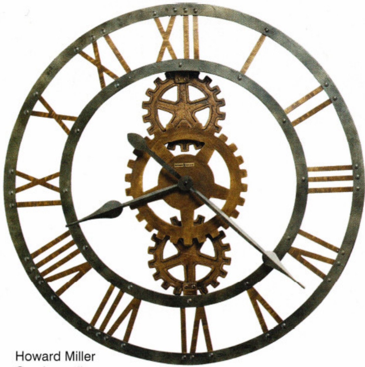
Howard Miller Crosby wall clock from Ben's Furniture