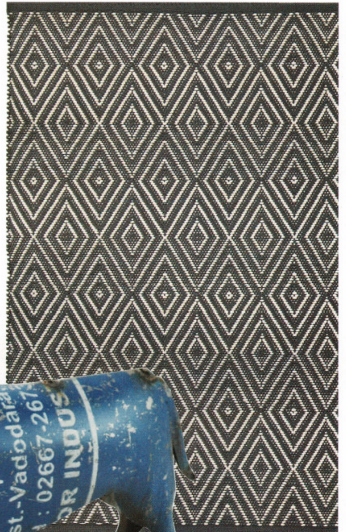
Dash & Albert Rug Company Diamond Graphite Ivory Indoor Outdoor Rug from The Cottage