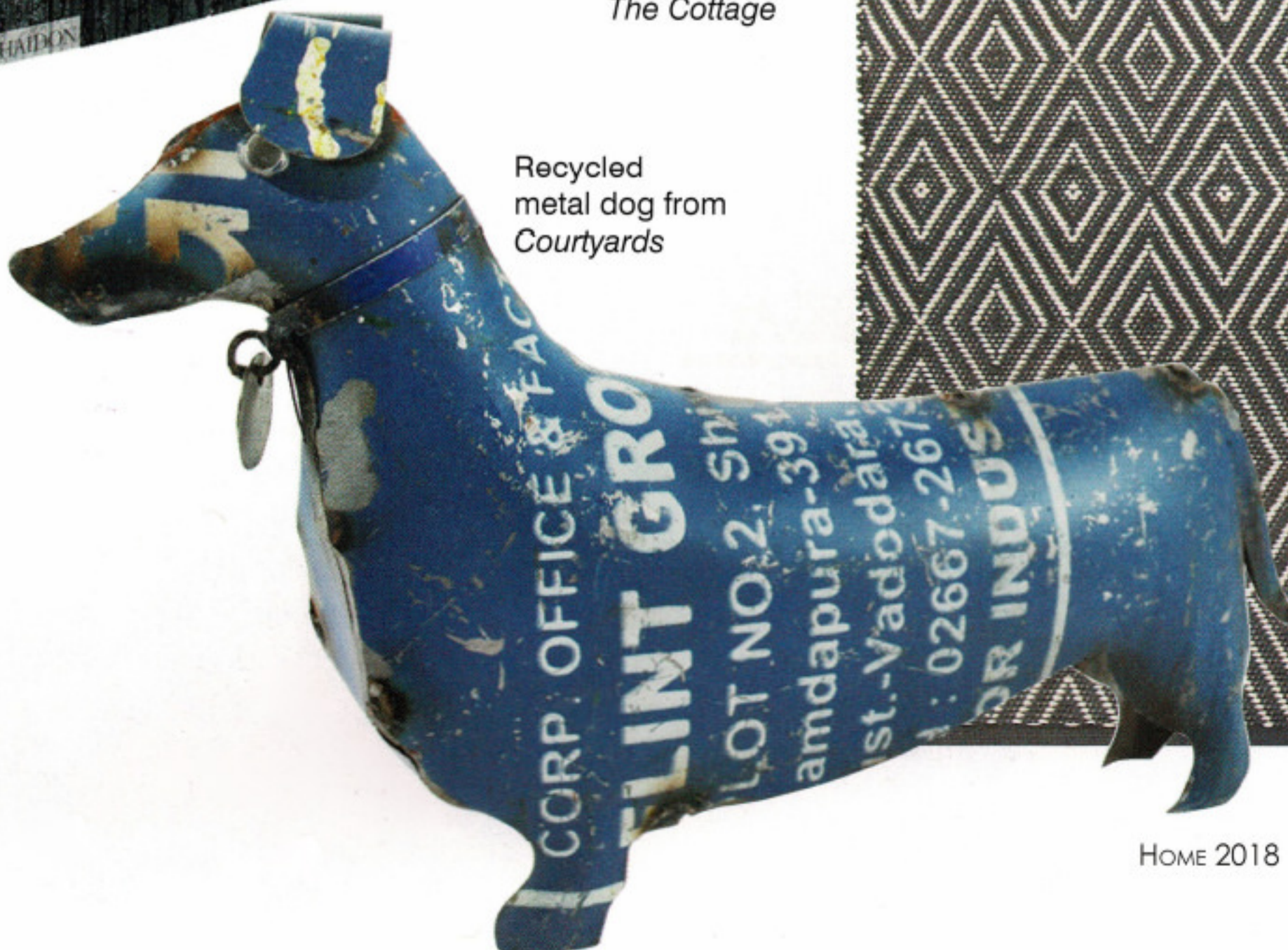
Recycled metal dog from Courtyards