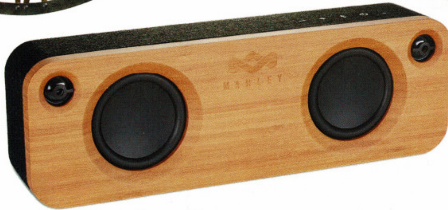
House of Marley Get Together Travel Speaker from Jamestown Outdoors